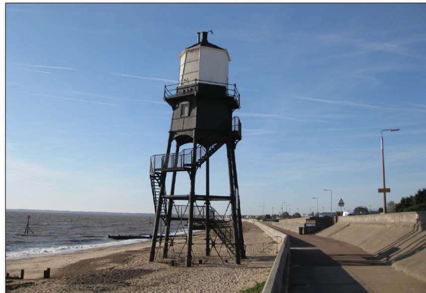
Dovercourt's High lighthouse high and dry on the sands.