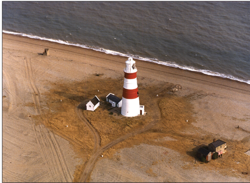
Orford Ness lighthouse as seen from the air – or from an alien spacecraft?