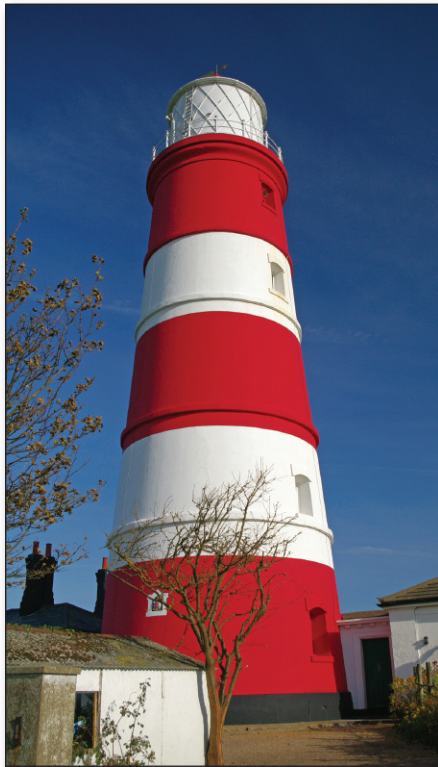
The stripy bands of the Happisburgh High Light date from 1883. ROBIN JONES